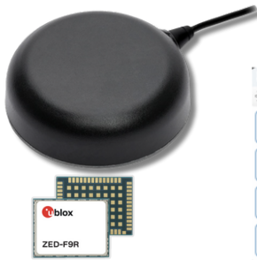
TP5790 Smart GNSS Antenna

The Calian TruPrecision SDK is a Windows application which provides an autonomous connection to stream Swift Navigation Skylark corrections to the TP5790 Smart Antenna . Additionally, a Virtual COM Port is provided to allow customers to connect to their existing applications within the Calian Smart GNSS Antenna high precision “corrected” position data output. The position data may be either NMEA or UBX formatted messages.