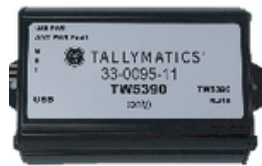
Serial to USB Bridge