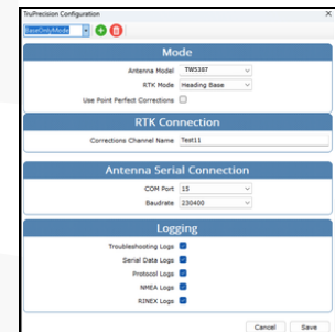
TruPrecision Software Configuration