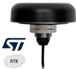
TP5387 Smart GNSS Antenna

The Calian TruPrecision SDK is a Windows application which provides an autonomous connection to stream Skylark corrections to the TP5387 Smart Antenna via serial to a USB Bridge cable (CMOS version). It also provides a Virtual COM Port to allow customers to connect their existing applications to the TP5387 Smart Antenna position data output. Position data is output as NMEA Formatted messages. ROS2® Drivers are available for integration with ROS2 open framework projects.