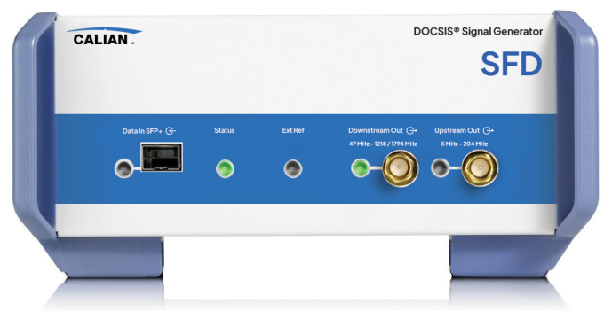
Front of the Calian SFD