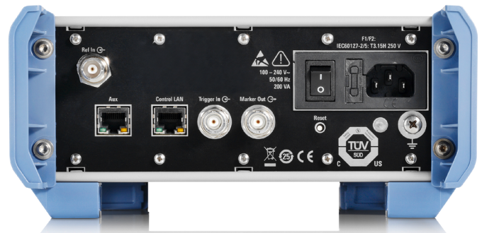
Rear of the Calian SFD