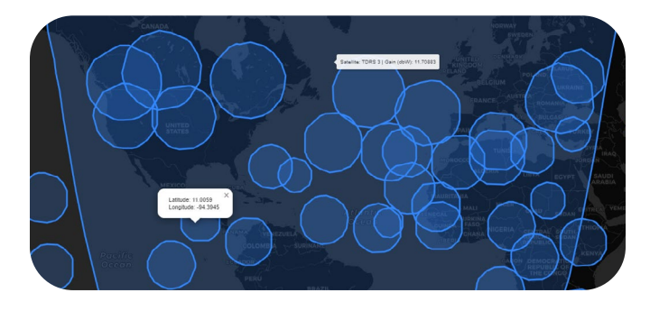
\label{eq:Madel} \mbox{Multi-orbit projection of a single NADIR beam for TDRS~3~and~100~Starlink~Satellites~(8ms~per~timestep)

A parallel solution that computes data across thousands of points per operation enables high resolution computations. This improves fidelity and decision making as beams become more focused and links become more dynamic. EarthMesh supports variable spatial and temporal resolution to best fit the needs of your requirements. Regions of interest can have increased resolution over the global simulation to further increase the value of data outputs.