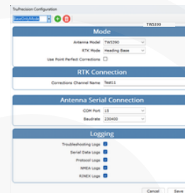
TruPrecision Software Configuration