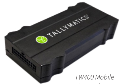
TW400 Mobile IOT Tracker

Small and discreet, the cellular tracking unit can be mounted on the dashboard or placed in the glove compartment to monitor driver behavior. TruFleet utilizes the cellular box's accelerometer (motion sensor) and responds instantaneously to pre-defined conditions related to time, date, location, and can detect hard braking, aggressive acceleration and vehicle impacts. Using Tallymatics' proprietary Route GeoData Compression, TruFleet displays and records the user's whereabouts real-time with 12x resolution versus the competition.