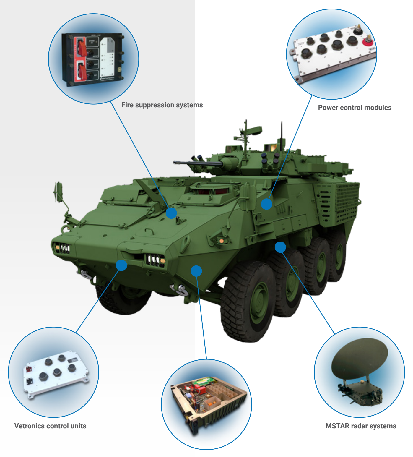
High- power VHF radio amplifiers

Calian designs, manufactures and tests vetronics products that are in use across a variety of combat platforms, combat networks and security and surveillance applications.