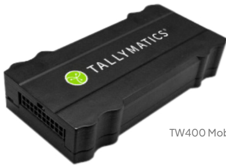
TW400 Mobile IOT Tracker

Small and discreet, the cellular tracking unit can be mounted on the dashboard or placed in the glove compartment to monitor driver behavior. TruFleet utilizes the cellular box's accelerometer (motion sensor) and responds instantaneously to pre-defined conditions related to time, date, location, and can detect hard braking, aggressive acceleration and vehicle impacts. Using Calian's proprietary Route GeoData Compression, TruFleet displays and records the user's whereabouts real-time with 12x resolution versus the competition.