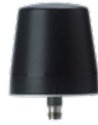
TW3742AJ L1/E1 GNSS Coverage

Proven Jamming Resilience (XF+) Designed for Marine Environments Spoofing Resilience/Protection