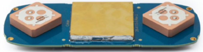
CR7712EXF 2-element single null adaptive beamforming antenna

Together, these products deliver tailored, mission-ready solutions tested for environmental, mechanical, and electromagnetic extremes for a spectrum of applications—enhancing system resilience and situational awareness wherever your mission takes you.